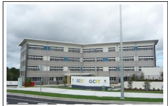
The recently opened Coomera TAFE will offer vocational training in information technology, the creative industries and computer-based training for construction/engineering courses

It is significant that the Northern Corridor accounted for 1,062 new dwelling approvals, 54% of the total for Gold Coast-Tweed in 2010/11 to March.