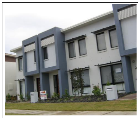
Townhouses at Arcadia Woods

Other duplex and terrace style dwellings on lots of around 200 square metres are included in numerous developments in close proximity to the proposed Coomera Town Centre. They offer investment opportunities from around $360,000 to $400,000, with three bedroom dwellings of around 160 square metres including a single garage available for rent from $310 to $340 per week in the Pimpama-Coomera area and two bedroom dwellings sold for $299,000 for a 107 square metre dwelling for rent at $290 per week.