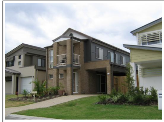
Small lot detached houses within the immediate Coomera Town Centre catchment

Ability to sell existing homes in the current more subdued conditions continues to impede sales at many such estates that are mainly targeted to owner occupiers.