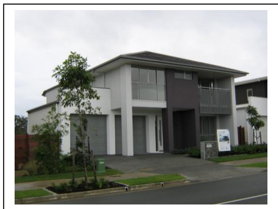
One of Mirvac's family homes in the Terrace Green precinct at Gainsborough Greens

Golf course memberships are available separately – the golf course is being upgraded and redesigned by Ross Watson. House and land packages are available, with the initial Mirvac homes opposite the Recreation Hub priced in the $595,000 to $625,000 range. A builders display village of around 30 houses is scheduled to open in late 2011. Mirvac has achieved steady sales since the release in September 2010, mainly to builders and to upgraders from Brisbane and nearby estates.