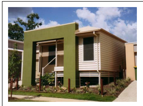
Studio house at Springfield Lakes

Located close to the Orion Town Centre, under construction for completion next year and the University of Southern Queensland's Springfield Campus in Brisbane's western corridor, Studio house and land packages were originally released from $199,000 around 18 months ago. Prices now start at $228,000. They have primarily sold to young singles and couples, including students.