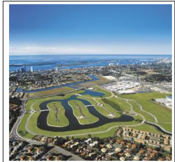
Harbour Quays, Gold Coast