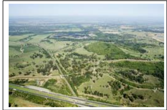
Menangle Park, South West Sydney

Child care facilities 2009, 2013 & 2017 Retirement living & aged care facilities 2017-18 Queensland marina berth research 2006 & 2015 Self Storage PIR evaluations 2003-2006