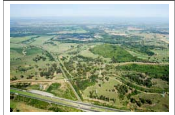
Menangle Park, South West Sydney

Child care facilities 2009, 2013 & 2017 Retirement living & aged care facilities 2017-18 Queensland marina berth research 2006 & 2015 Self Storage PIR evaluations 2003-2006