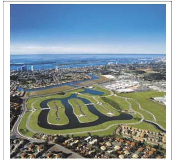
Harbour Quays, Gold Coast