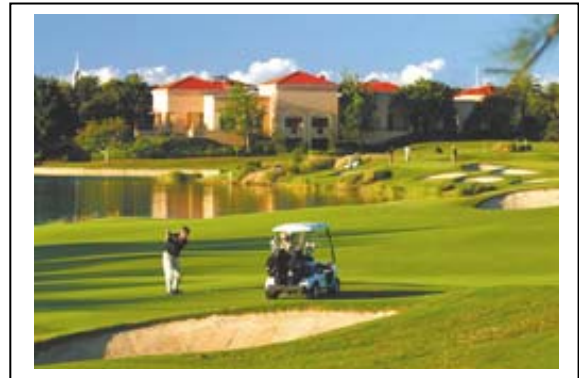
Hope Island Resort, Gold Coast