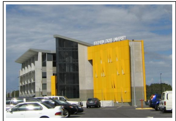
The new Southern Cross University building at Gold Coast Airport, opened in February 2010, with a second building already planned

The southern part of the Pacific Motorway continues to offer bottleneck conditions to motorists in peak hours. The current roadworks to upgrade the road to six lanes between Nerang and Varsity Lakes are due for completion in late 2011. Timing of the upgrading of the remaining sections south of Varsity Lakes is unknown, but planning is currently underway.