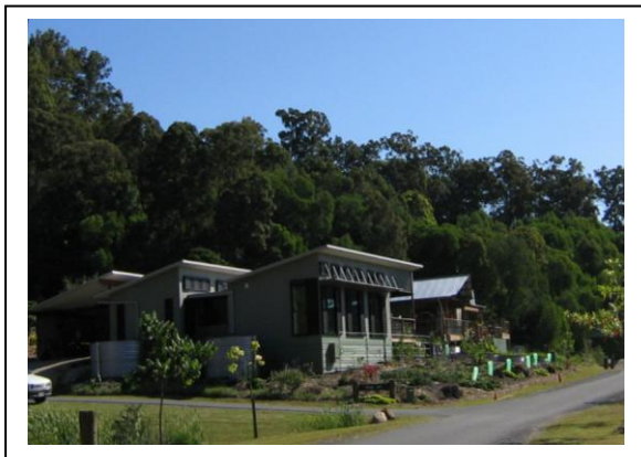
Ecovillage at Currumbin - low intensity housing and living with nature

In Tweed Shire, the major estates currently marketing include: