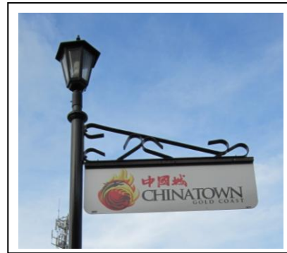
Creation of Chinatown in Davenport Street may coincide with the proposed addition of direct flights from Guangzhou.

TOD precincts are typically characterised by medium to high density, mixed-use development, with a high quality public realm that promotes active transport (walking and cycling), use of public transport and a reduction in car dependency.